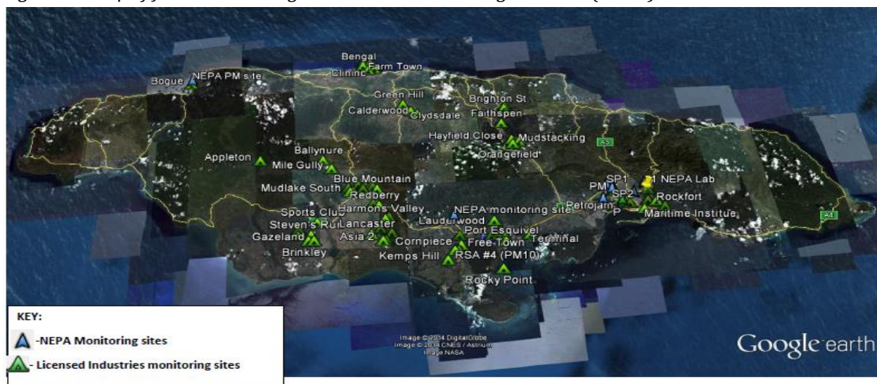
Figure 1: Map of Jamaica showing Ambient Air Monitoring Network (NEPA)

The network is distributed across the island, with 80% (60) located outside of the Kingston and St. Andrew region, as shown in Figure 1. 15