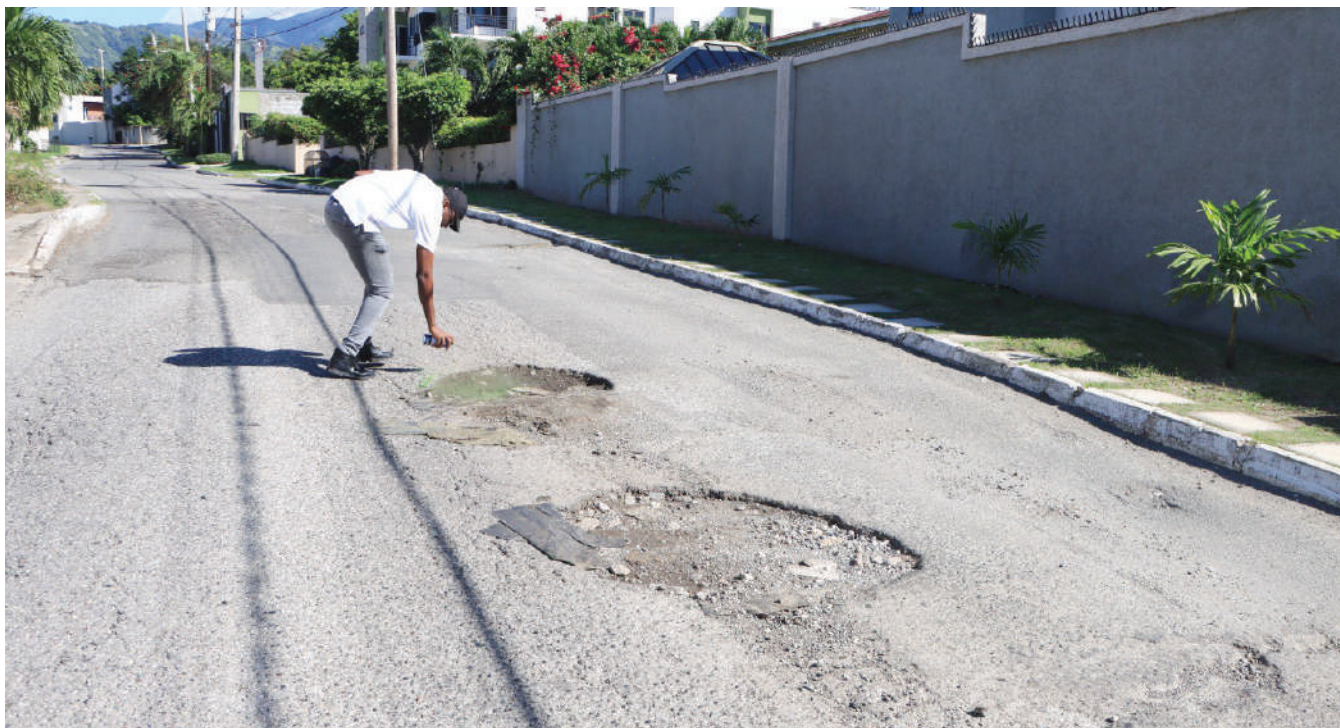
REACH Programme - Russell Heights Road Assessment