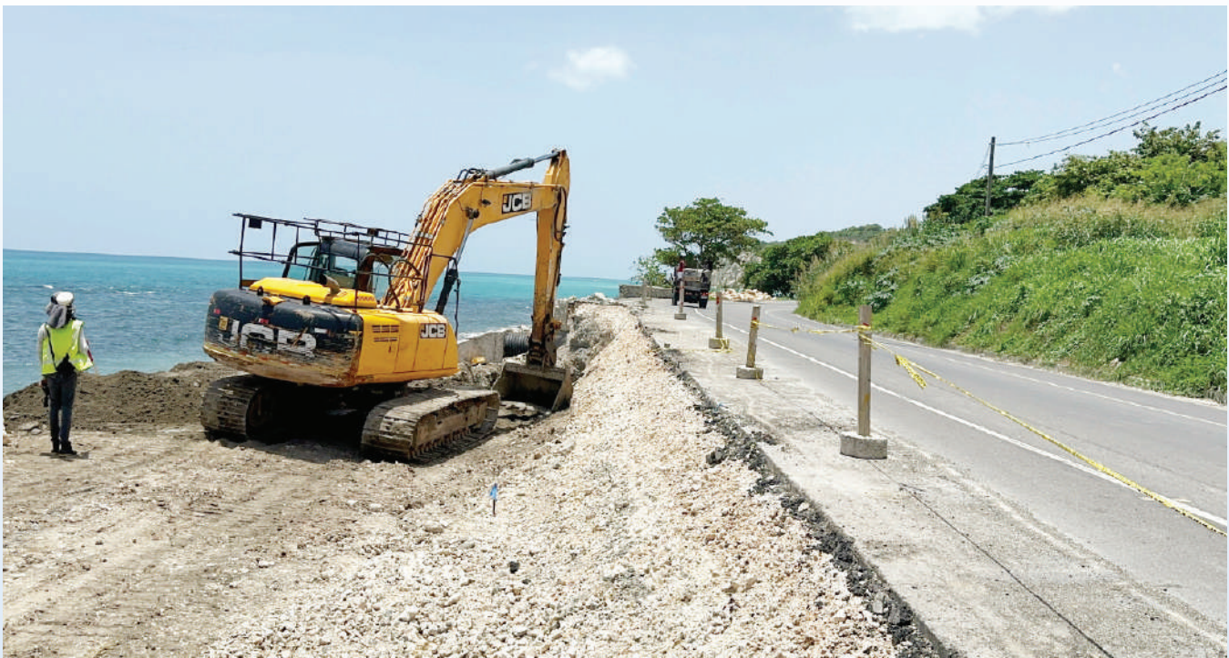
SCHIP Road Works In Progress

Madam Speaker , we are now at the tail end of the over US$575 million Southern Coastal Highway Improvement Project (SCHIP) Project . This project, which has transformed sections of Clarendon, Manchester, St. Andrew, St. Thomas and Portland is another testament to our commitment to infrastructure development. The project is 96% complete, with two major components — Part A (May Pen to Williamsfield Toll Road Extension) and Part B(ii) (Harbour View to Yallahs Bridge, covering 17.4 km of a four-lane highway) — already open to the public.