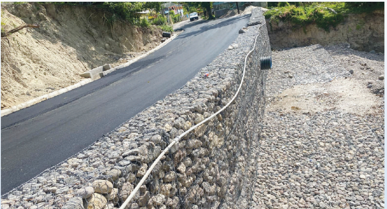
Completed Retaining Wall repair, Suttons, North Central Clarendon