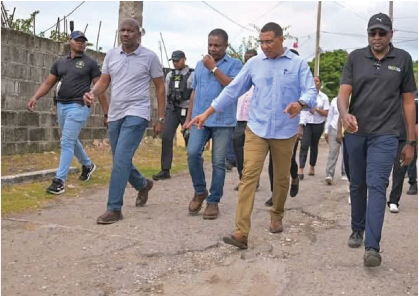
Everest Drive, SPARK Launch

Madam Speaker , the Shared Prosperity through Accelerated Improvement to Our Road Network (SPARK) Programme is the single largest infrastructure investment in Jamaica's history.