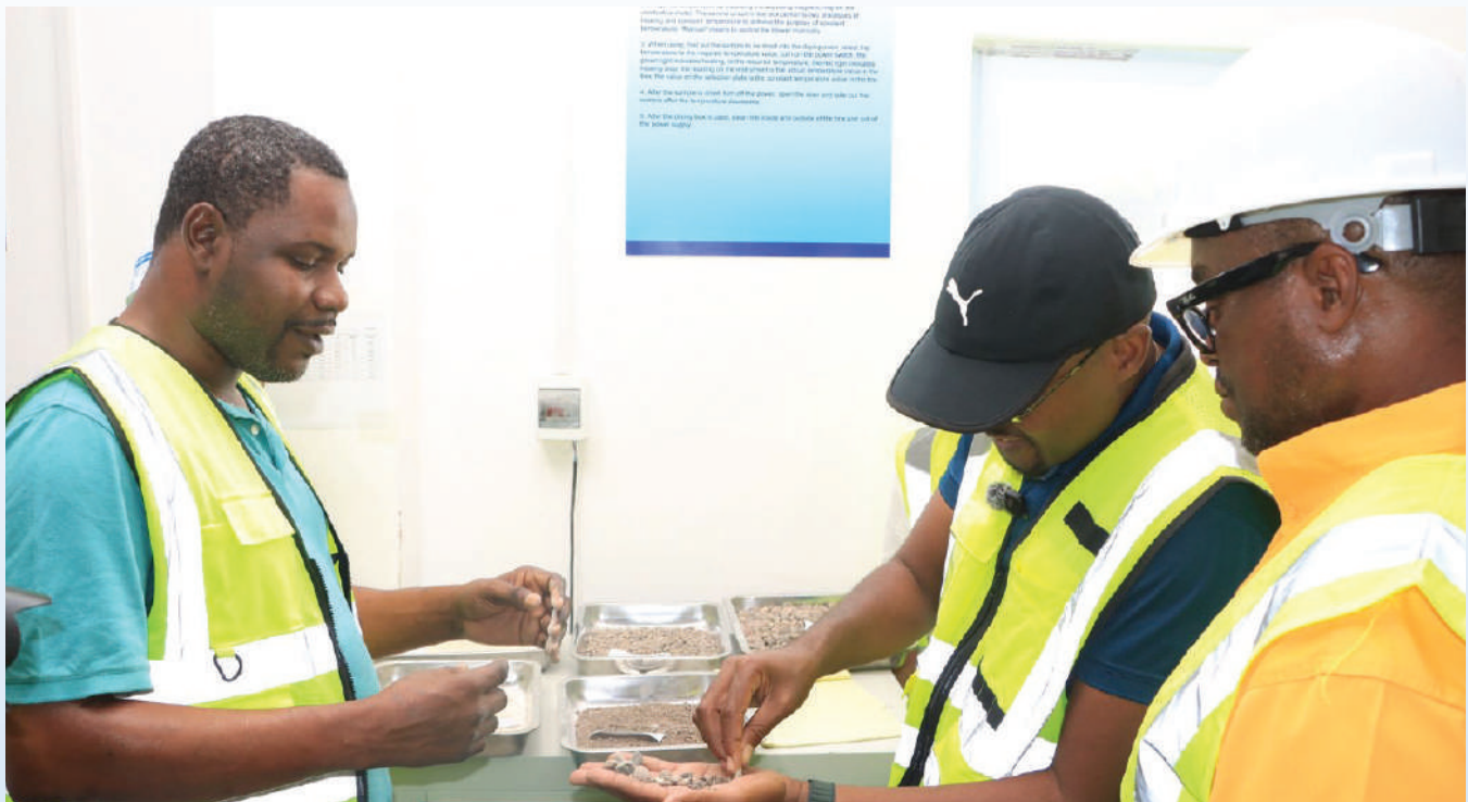
Montego Bay Perimeter Road Aggregate Testing Lab

I recently toured the project and am pleased to report that the Montego River bridge is 99% complete. The work on the project is advancing, with 60% completion, and are on track to be completed by May 2026. Madam Speaker , the READY framework is evident in the long-term planning and designs for climate change adaptation for this project. The Comprehensive Drainage Study will assess all major gullies that drain into the city and prepare detailed designs for implementation.