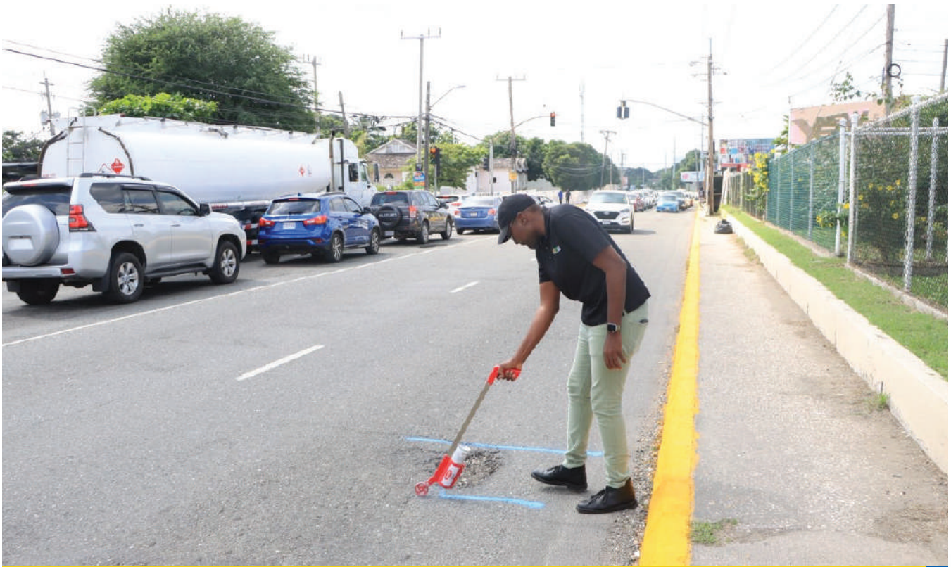
REACH Programme - Hope Road, Road Assessment