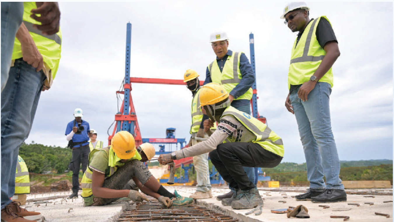
Steel Worker certified by HEART/NSTA Trust working on Perimeter Road

Under STEADY , 20 interns will be engaged with the SPARK Programme. This complements our partnership with HEART Trust to certify and train young Jamaicans working on the perimeter road. (Steel Worker certified by HEART NSTA working on Perimeter Road)