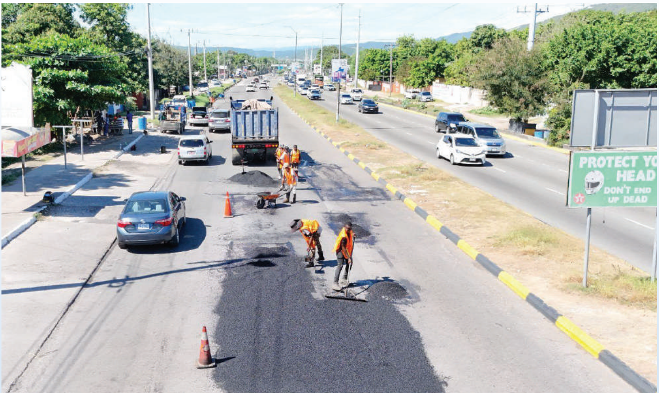
REACH Programme - Washington Boulevard Asphalt Laying