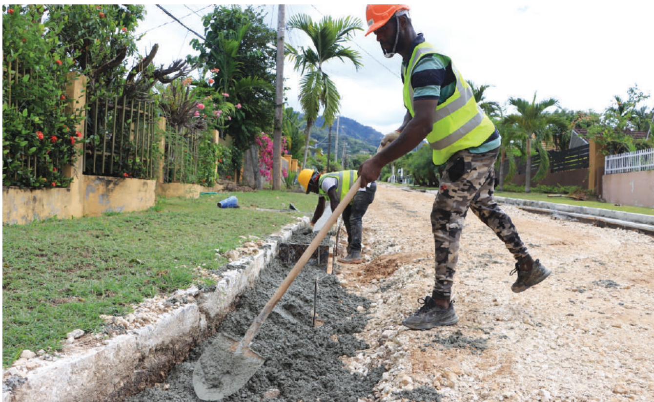
SPARK - Orange Grove Drainage Development

SPARK will be organised under two (2) categories of Works, namely: