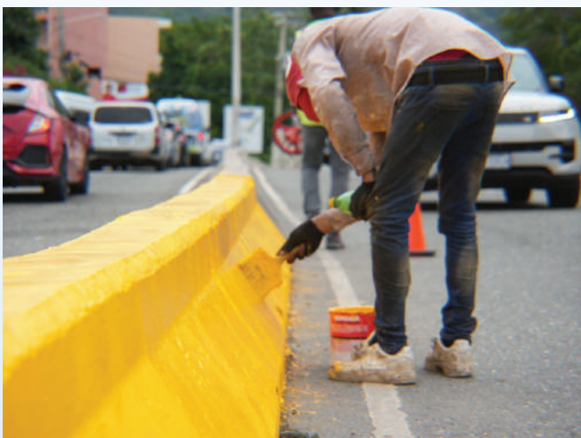
Barbican Corridor Transformation