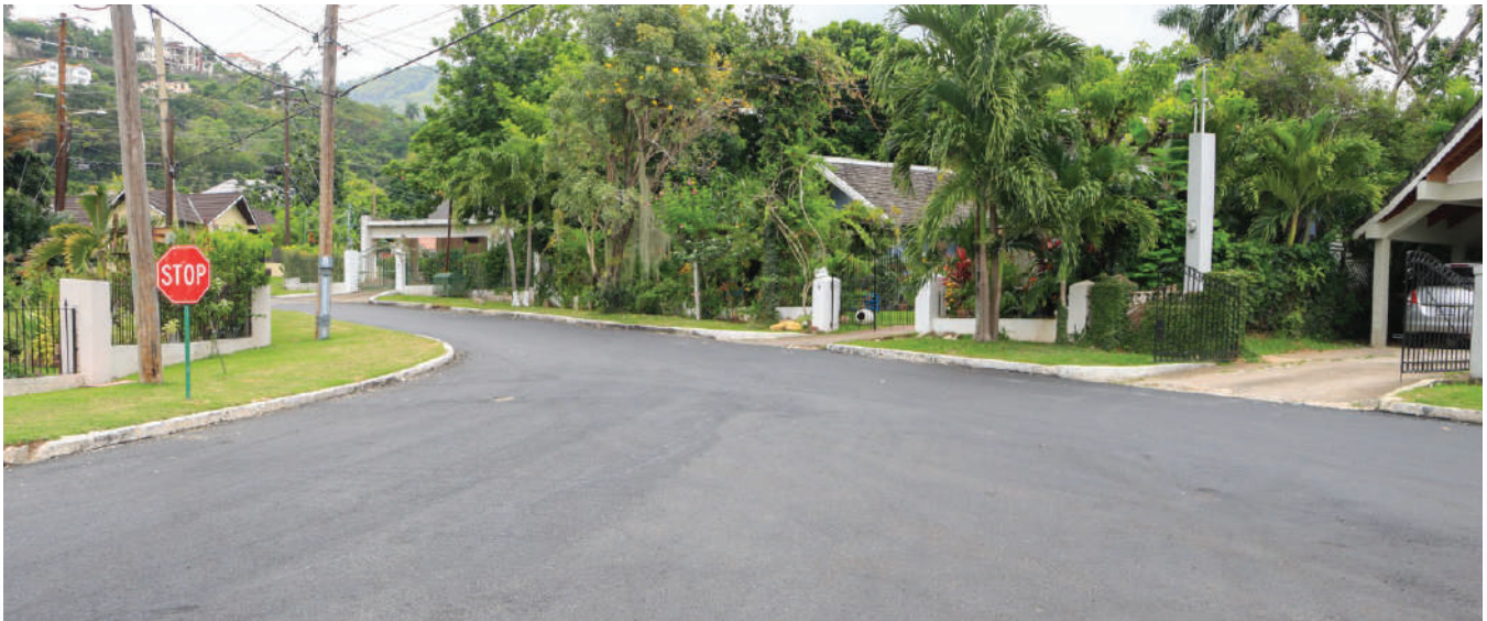
SPARK - Orange Grove, St Andrew