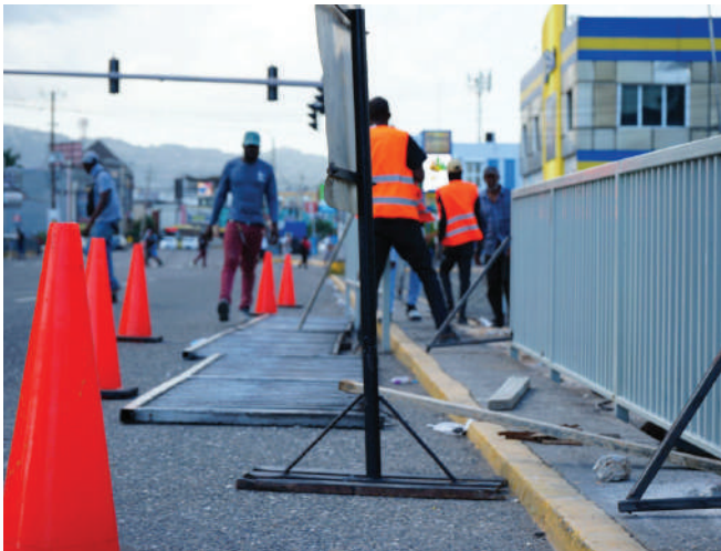
Half-Way Tree Transformation