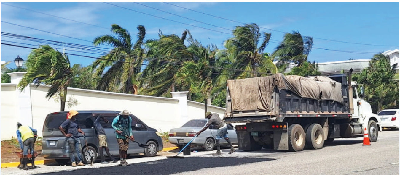
REACH Programme, St. James

Madam Speaker , as the caring and ready government that we are, our objective is to create a safer, more navigable road environment, reduce accidents, and support overall public safety. Thus far, streetlights along Elegant Corridor (Phase 1) and Bogue Road in St. James have been rehabilitated.