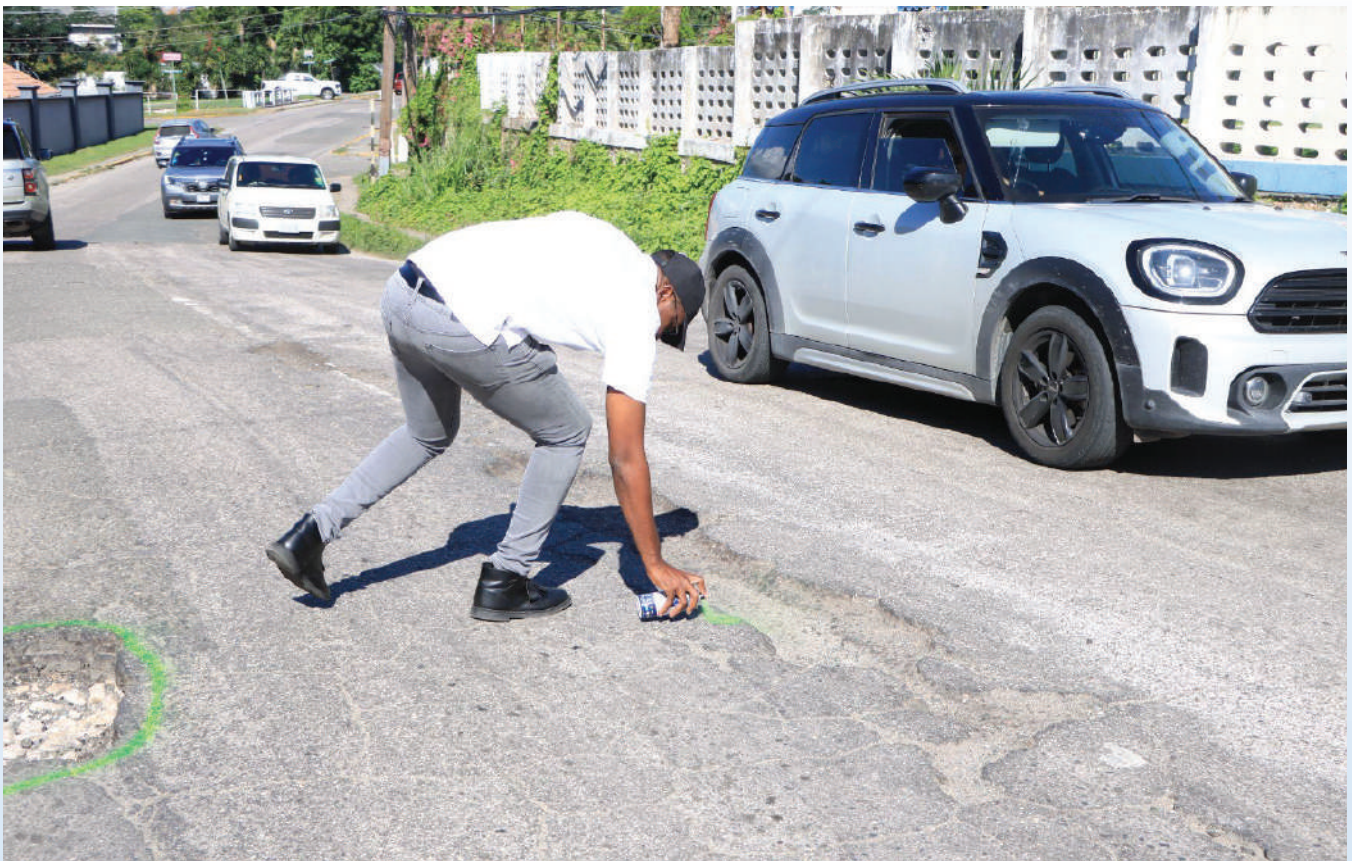
REACH Programme - Shortwood Road Road Assessment

Madam Speaker , all told, we are spending some $4.7 billion on emergency island-wide road patching. The emergency patching programme is 80% complete, while the broader $3-billion repair initiative is progressing steadily, with Phase 1 constituency-based works at 72% completion. Both phases are on track to be completed by June 2025.