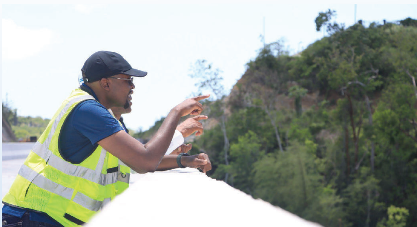
Montego Bay Perimeter Road Tour, May 8, 2025