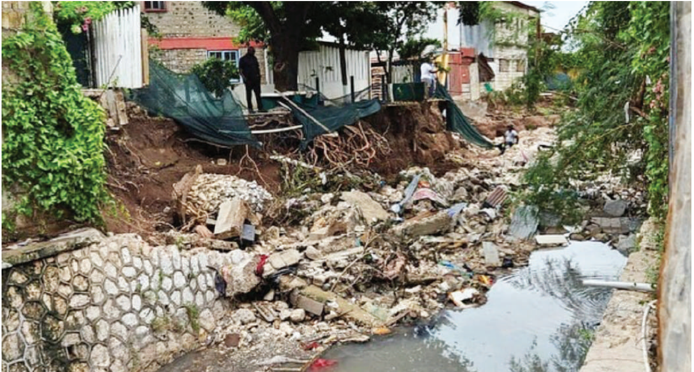
Damage to Retaining Wall for Construction

well as the North Gully and South Gully in St. James . These improvements are not only critical for flood control, but also for public health and urban development, ensuring that vulnerable communities are better protected and more sustainably integrated into the country's broader climate adaptation strategy.