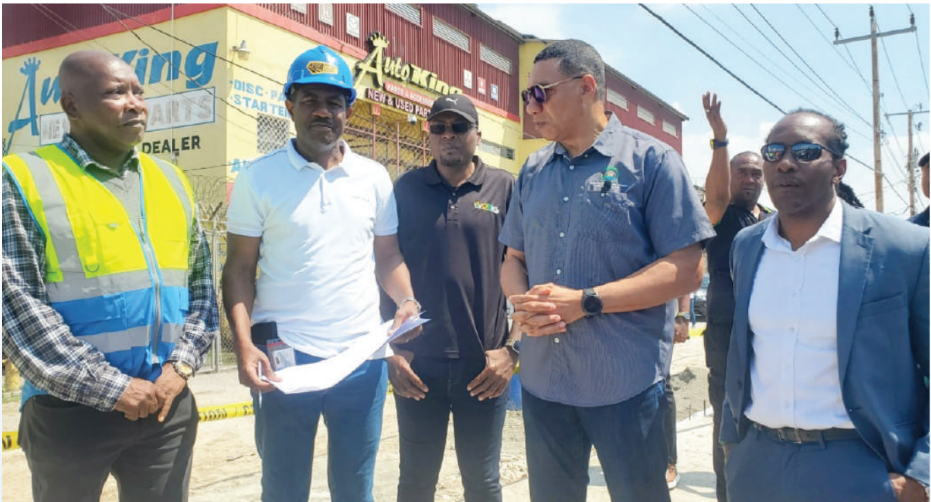
CAPEX Tour Grange Lane

I speak to the people of the parish of Portmore. More is coming! The Braeton Road and Hellshire Main Road dualisation project is set to commence shortly. Madam Speaker , this is a $2.4-billion investment for the benefit of the people of Portmore!