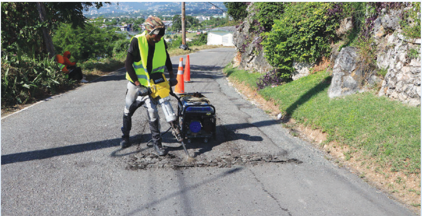
REACH Programme - Beverly Hills, Road Repair