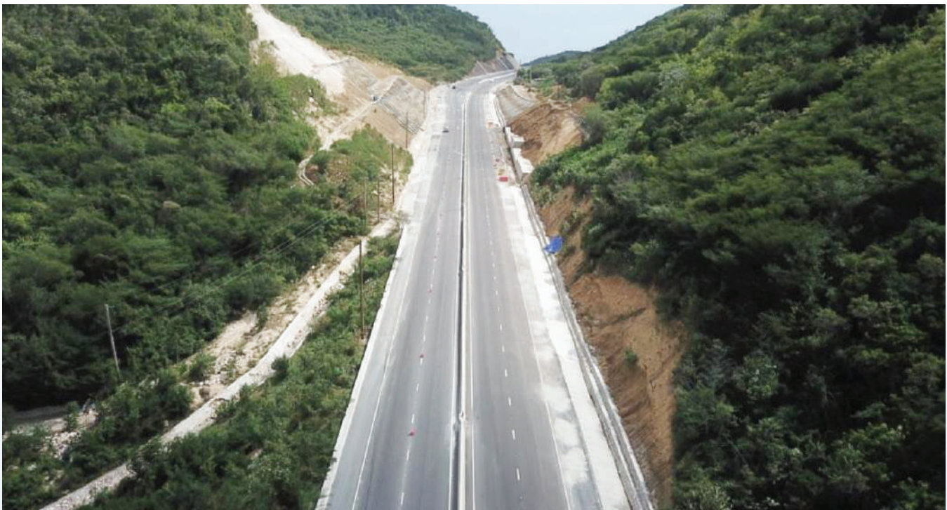
Aerial View of the Montego Bay Perimeter Road

Madam Speaker , we anticipate substantial completion of this phase of SCHIP by June 2025.